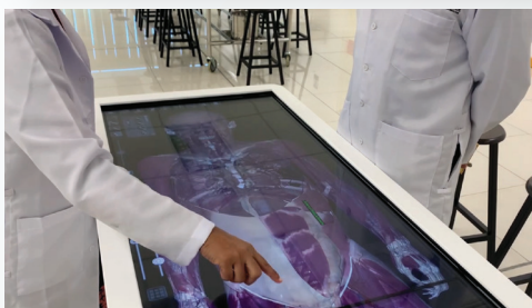
Electronic Dissection Table