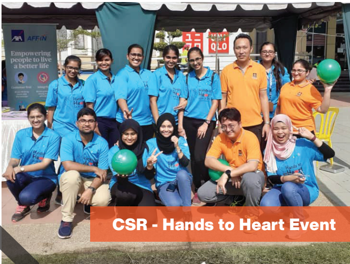
CSR - Hands to Heart Event